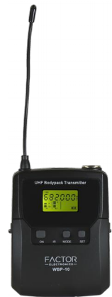
Optional WPB-10 Wireless belt-pack transmitter