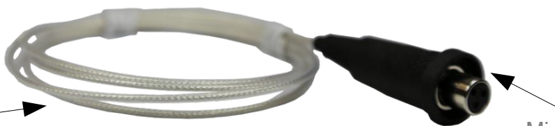
Miniature 3 pin XLR connector with rubber moisture-proof cover