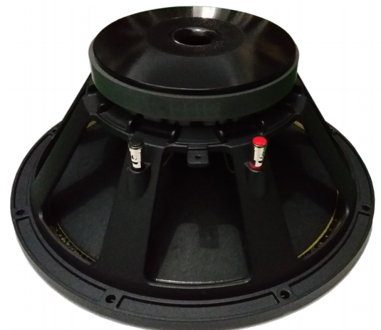
Cast frame 600W 15 driver 4"VC