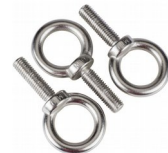
Optional 3 x M-10 fly bolts

(W) x16.9"/430mm (H) x 29.98"/760mm (D) x 16.5" 418.6mm Weight: 41kg/90 lbs